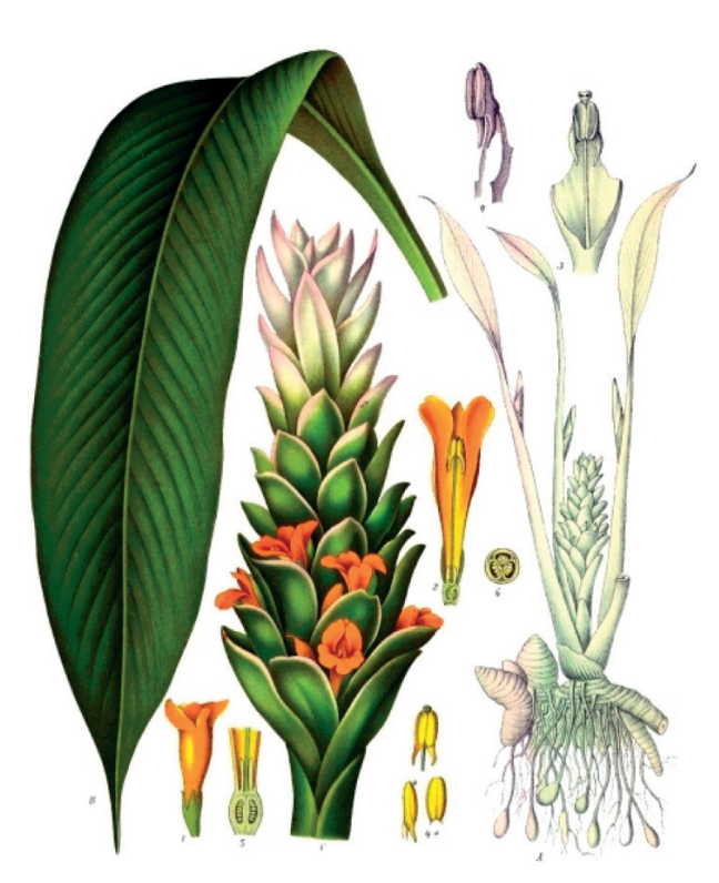
Figure 1. Curcuma longa (from Koehler's Medicinal-Plants).

Recent emphasis on the use of natural and complementary medicines in Western medicine has drawn the attention of the scientific community to this ancient remedy. Research has revealed that curcumin has a surprisingly wide range of beneficial properties, including anti-inflammatory, antioxidant, chemopreventive and chemotherapeutic activity. These activities have been demonstrated both in cultured cells and in animal models, and have paved the way for ongoing human clinical trials. Studies documenting the activities of curcumin, its mechanisms of action, and its chemical and clinical features are summarized in this review. Given the explosive growth of interest in curcumin and the extensive literature that has developed on this topic, reports cited in this review should be considered as illustrative rather than comprehensive.